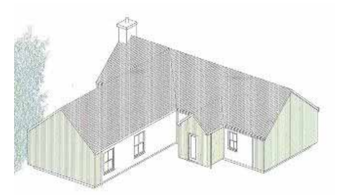
Fig. 6: 3D image Chalet no. 3

7. The third chalet follows a similar form to chalet no. 2, being a basic L shape. Again, the living accommodation is contained in the main section of the L, and a storage area and disabled bathroom are also contained in this element, along with the entrance vestibule which is accommodated in a traditionally designed pitched roof timber clad porch. The smaller wing of the L shape accommodates the three bedrooms, of which one is en suite. Chalet no. 3 is the most northerly of the three units. Supporting information refers to chalet no's 2 and 3 being designed to reflect the simple composition of a steading.