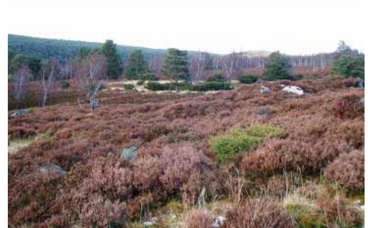
Fig. 2: Views towards the site, approaching from the public road to the east.