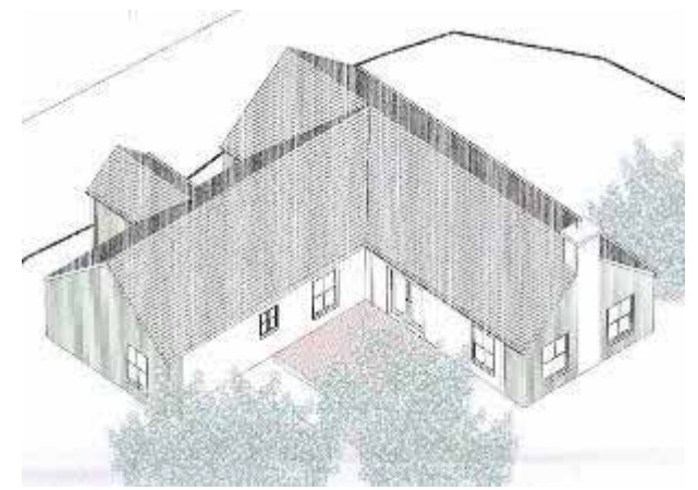
Fig. 5: 3D image Chalet no. 2