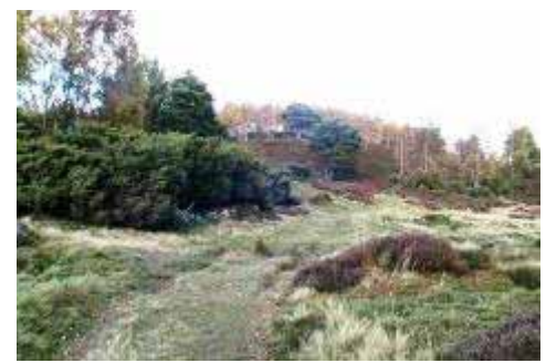
Fig. 8: Track and public rd. junction