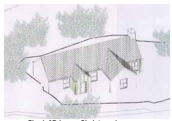
Fig. 4: 3D image Chalet no. 1

4. Further to concerns raised by the CNPA regarding the landscape and visual impact, as well as concerns regarding the potential impact on the natural heritage of the area, the applicants responded with design modifications and a significant re-arrangement to the site layout. The amended plans which have recently been submitted are significantly different from the original design concept and are essentially for three traditional cottages, sited to take account of the natural landforms and to ensure the retention of existing trees and other vegetation on the site.