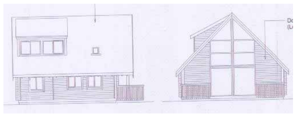
Fig. 3: Originally proposed chalet design

3. The nature of the design concept has evolved and altered considerably in the course of this application. At the outset, the proposal was for three A frame, timber clad<sup>6</sup> chalets, each being of identical design, with low sided walls and a steeply pitched roof forming the dominant feature, further emphasised by the overhanging eaves feature on the gabled front elevation. The front elevation of each of the units also incorporated a large double height projecting glazed area, from where access was proposed to a decked area. Entrance doors were also proposed on the rear and one of the side elevations. Internally, ground floor accommodation was proposed to consist of a large open plan kitchen, living and dining area, as well as a bedroom and bathroom. First floor accommodation was intended to contain a master bedroom and en suite, as well as a large open loft area.